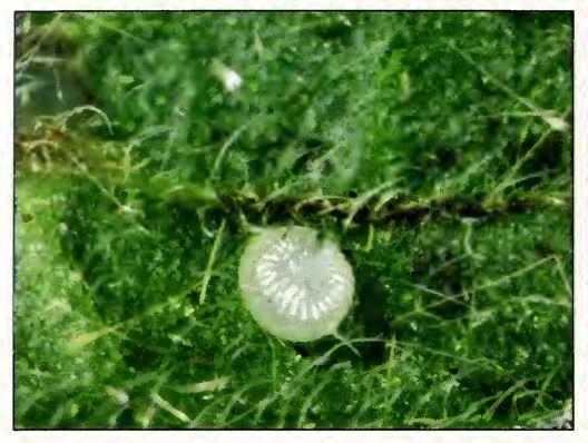
Fig. 5. Egg of Abrostola canariensis (La Gomera, Fig. 6. Young larva of Rhynchina canariensis (La December 2011).